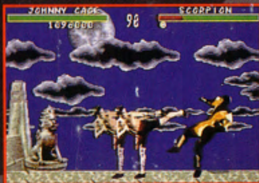
Arena's Mortal Kombat®

Look for this symbol — it indicates the best Activator games.