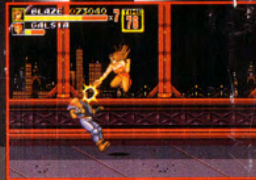
Streets of Rage 2™