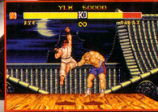
Capcom's Street Fighter II™: Special Champion Edition