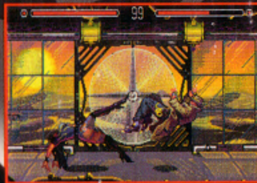
Eternal Champions™ Coming in December!