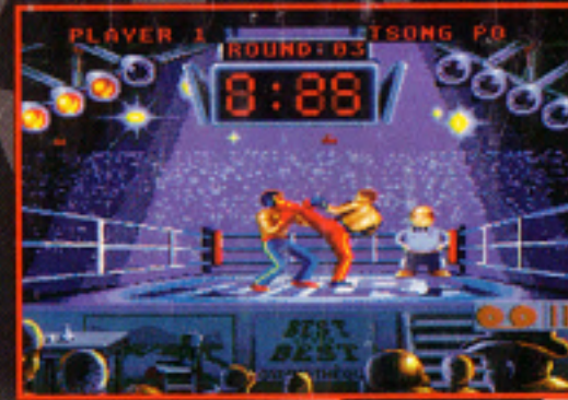
Electro Brain's Best of the Best Championship Karate™